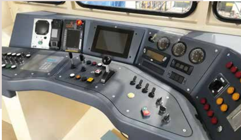
Control panel (1 dashboard per cabin)