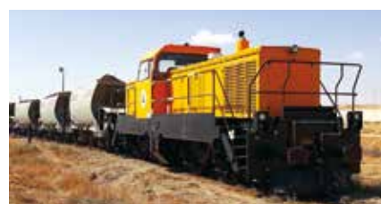
NH 700 BB 750 CV - 35 km/h