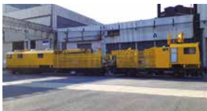
Hybrid Catenary Maintenance Vehicle 550 CV - 100 km/h