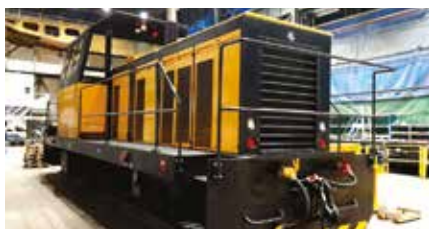
DE 600 C 612 CV - 50 km/h