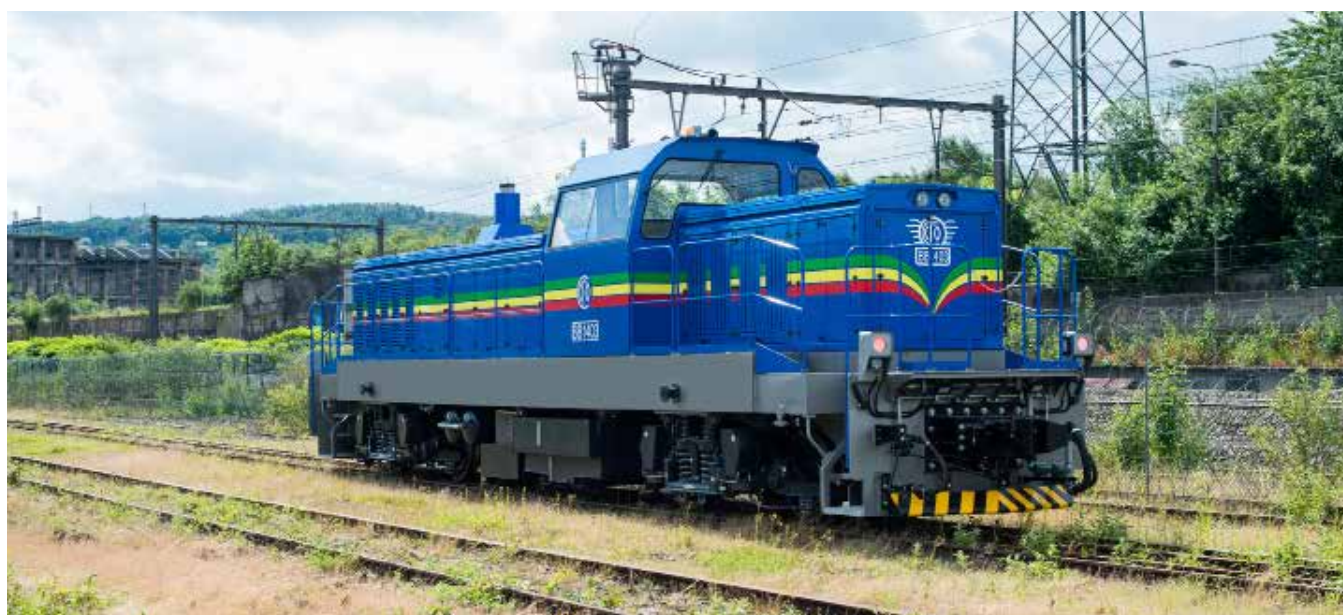
Multi-purpose freight and passenger locomotive