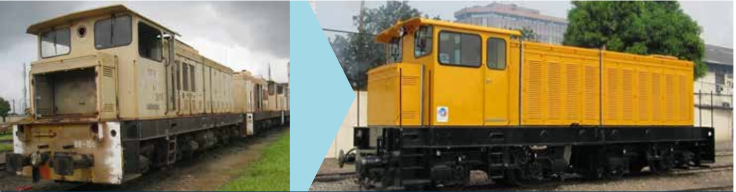
Modernized henschel hydrodynamic locomotives (Ivory Coast)

Moreover, a refurbishment done in customer premises, with customer's team, leads to an improved knowledge of the material by this team, and stronger collaboration relationship between John Cockerill and the customer