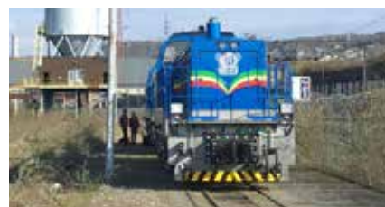
DE 1200 BB 1200 CV - 90 km/h