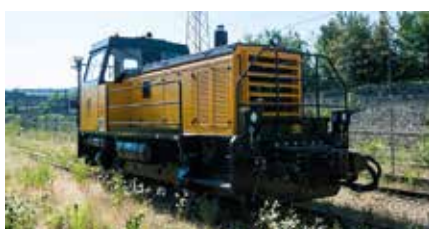
NH 300 B 350 CV - 30 km/h