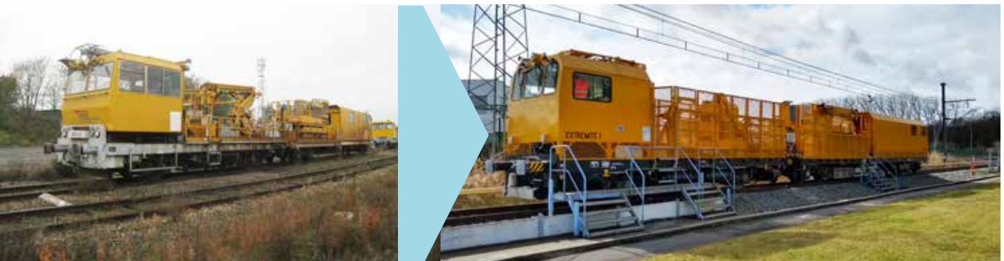
Hybrid Catenary Maintenance Vehicle with hybrid transmission