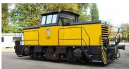
NH 500 B 525 CV - 60 km/h